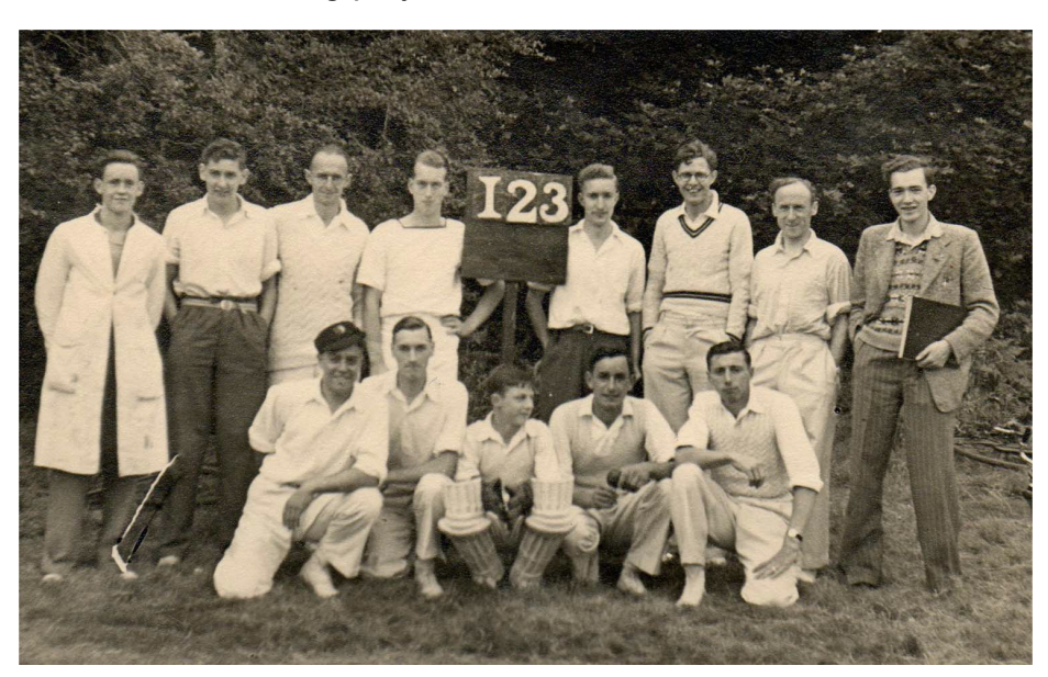
CHESHAM BOIS C. C. 1950

As the 1950's evolved more players owned cars so gradually Chesham Bois entertained teams from further a field, also Sunday sport was beginning to take place resulting in more fixtures being played.