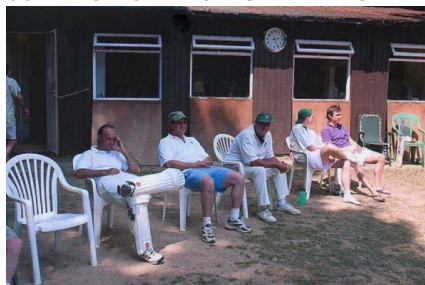
RESTING IN THE SHADE