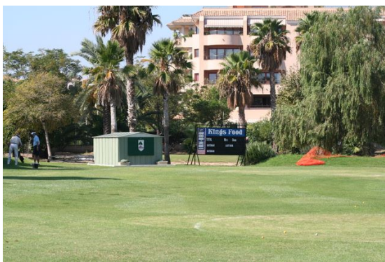
Views of the Columbus Oval on 30 th September 2007.

30 Sept. Forty Club of Spain C.C. v Chesham Bois C.C. played at The Columbus Oval. Chesham Bois won the match. Match details not known.