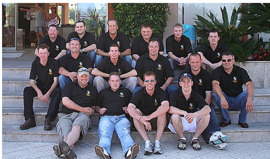
2007 Tourists to Spain.

In 2007 the club decided to return for a second tour to Spain, following the success of the 2004 tour. Two matches were again arranged against the same opposition as the previous tour, one, against Forty Club of Spain C.C., being played and one, against Sporting Alfas C.C., sadly being rained off.