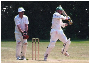
ROSS KEMP HITS OUT