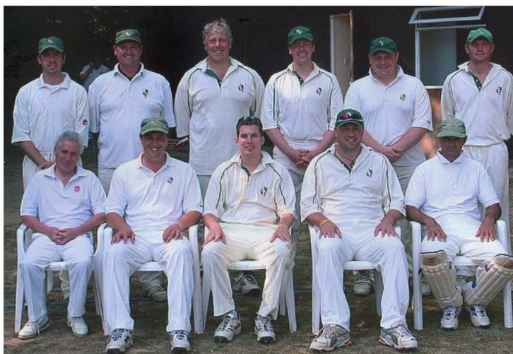
CHESHAM BOIS XI